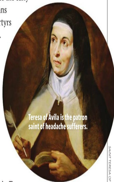
Teresa of Avila is the patron saint of headache sufferers.

From Dear Padre: Questions Catholics Ask , © 2003 Liguori Publications