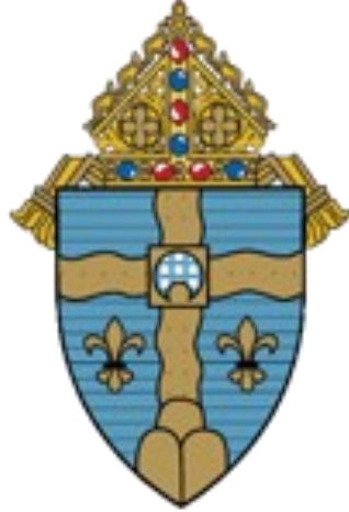
Diocese of Joliet