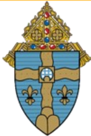
Diocese of Joliet

THE 2015 CATHOLIC MINISTRIES ANNUAL APPEAL (CMAA) IS UNDERWAY