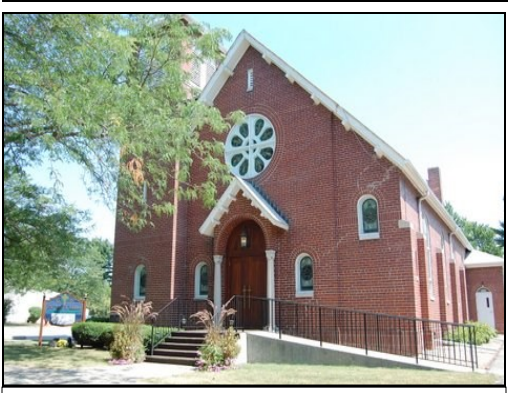
Our Lady of Lourdes Catholic Church