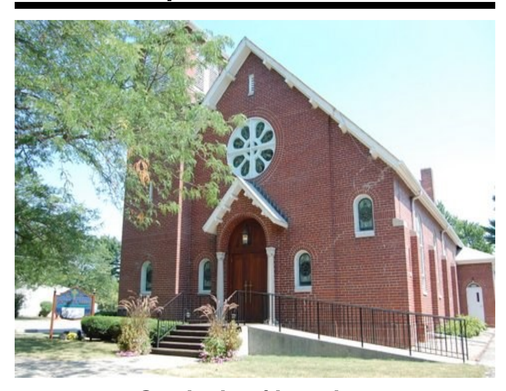
Our Lady of Lourdes Catholic Church