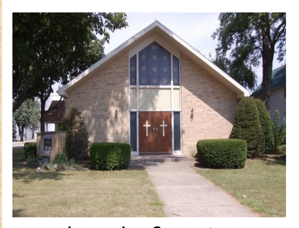
Immaculate Conception Catholic Mission