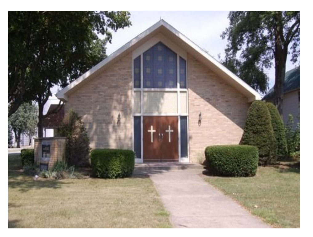
Immaculate Conception Catholic Mission