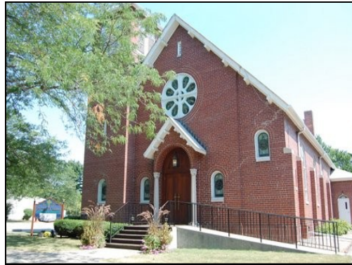
Our Lady of Lourdes Catholic Church