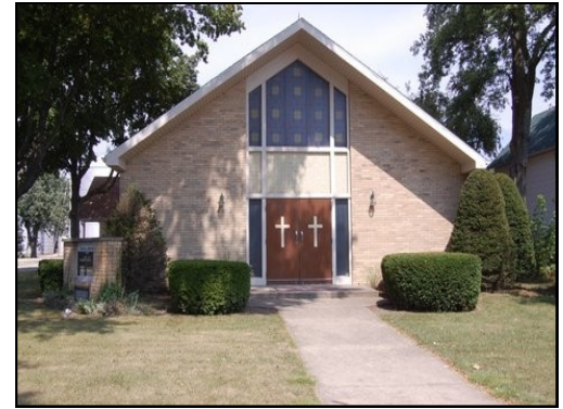
Immaculate Conception Catholic Mission