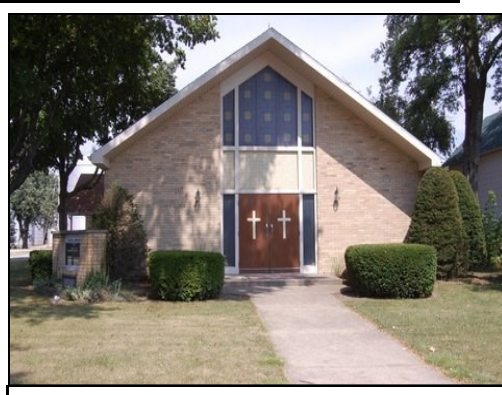
Immaculate Conception Catholic Mission